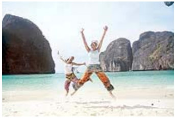
Tourists can return home with not just good memories but with a better health as well.

"More than that I can get everything at half the price I would be required to pay in Sydney. The service and expertise of doctors are of the same standard. I can't be happier," she said.