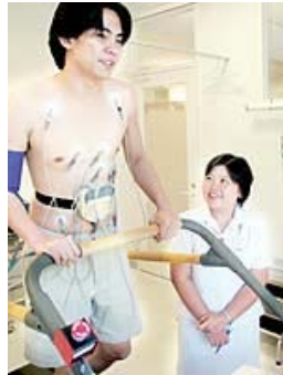
Medical check-up has become an integral part of the travel itinerary.

Dentistry, lasik, plastic surgery, breast enhancement, sex transplant, facial and beauty treatment are particularly popular among foreigners. And the other reason they come to Thailand is that they can keep it private and remain anonymous.